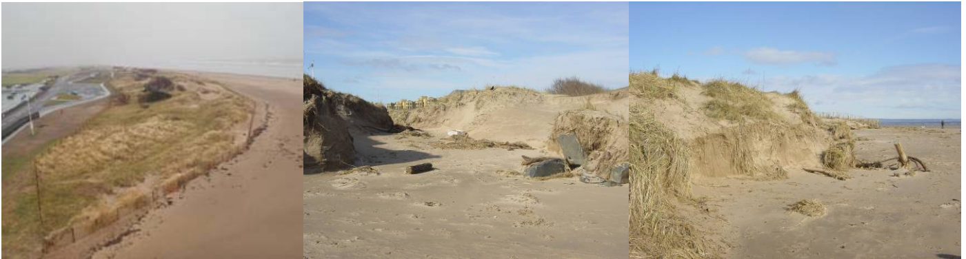
Storm damage to the West Sands dunes March 2010

The West Sands, made famous around the world in the film "Chariots of Fire" and as a spectacular backdrop to The Open, was the scene of a different sort of race in 2010.