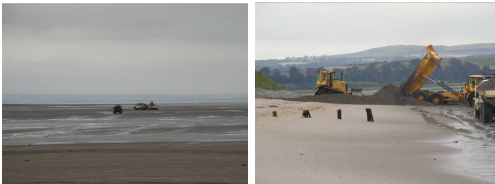
Sand excavation from the estuary

This was followed further along the coastline with a revised approach; sand recharge. This beach nourishment project buried the installed gabions and built a new 300 metre dune along the remaining soft dune system to the north of the new gabions. Sand was excavated from a part of the sand flats to the north and transported to the dunes by low ground pressure trucks, it was then shaped by bulldozers. These sand flats have been steadily growing in size over the past 20 years. The Environmental Impact Assessment (EIA) process ensured that mitigation measures were put in place so there was no significant disturbance to the breeding bird sites, mudflats, sand flat, sand dune and saltmarsh habitats and the common seals that visit the estuary and bask on the sand banks at low tide. Permission for further sand recharge work was given in 2008 to ensure the area continues to be effective in combating the dune erosion.