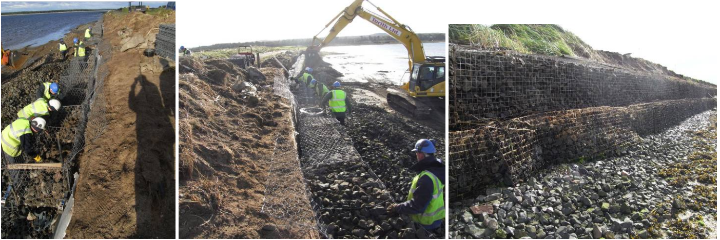
Construction of gabion baskets

In 2001, 100 metres of hard defences were constructed along the eroding dunes at the end of the Jubilee course. This consisted of a line of contoured sloping gabions, which are large metal baskets filled with rocks. These stabilise the dunes and stop the sand from being eroded away by absorbing the energy of the incoming sea.