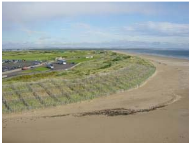
Sep 2011 –Lyme and marram grasses were transplanted from other areas of the dune

Jute matting and chesple fences were installed to stabilise the dune until vegetation was fully established.