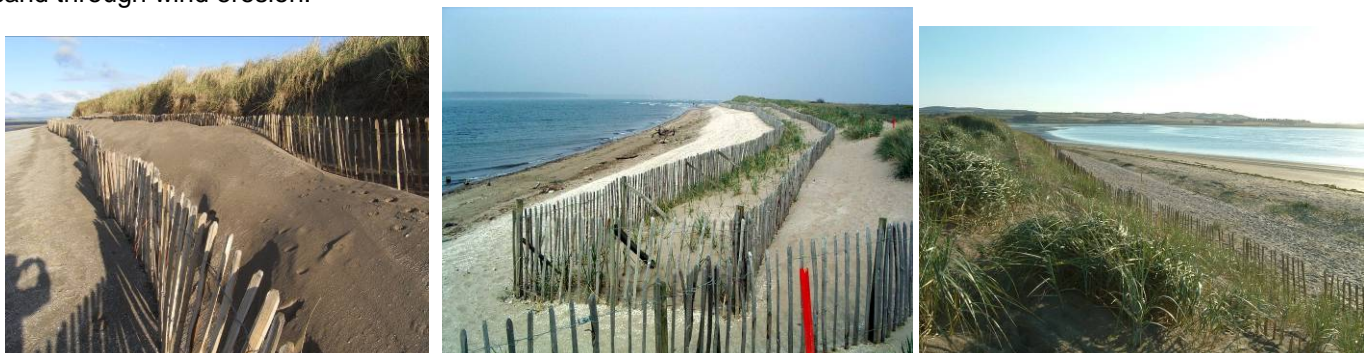
Sand recharge area

Further protection of the sand dunes and sand recharge area was achieved through a softer coastal engineering approach that included chestnut paling fences and marram and sea lyme grass planting. The grass acts as a natural dune stabiliser by trapping and binding sand with their roots and vegetative growth, which also reduces the loss of sand through wind erosion.