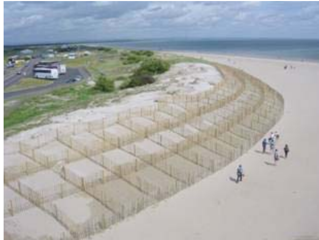
July 2010 - Dunes taken after restoration

Jute matting and chesple fences were installed to stabilise the dune until vegetation was fully established.