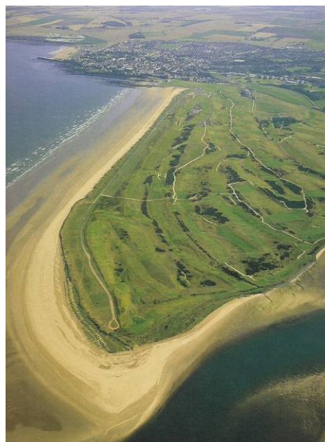
St Andrews Links

The historic, recreational and economic value of St Andrews Links means that there is a need to protect these areas. Following considerable research, St Andrews Links Trust in partnership with Fife Council, Scottish Natural Heritage and the Fife Coast and Countryside Trust has taken various coastal protection measures over the last decade. These have required permissions under the Environmental Impact (Scotland) Regulations and licenses under the Control of Pollution Act (COPA) and the Food and Environment Protection Act (FEPA), which are enforced by the Scottish Environment Protection Agency (SEPA).