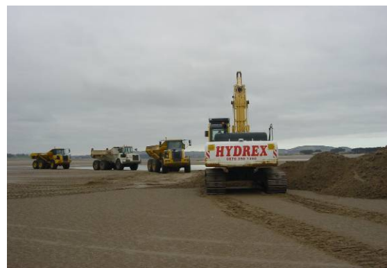
Sand excavation and haulage